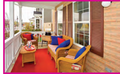
Legacy Square, Park Forest, Ill.

Park Forest, for example, facilitated the development of small lot, single-family detached homes in its downtown in an attempt to diversify the housing stock and bring more activity to that area. Park Forest engaged Bigelow Homes, which is selling two and three-bedroom homes in the neo-traditional Legacy