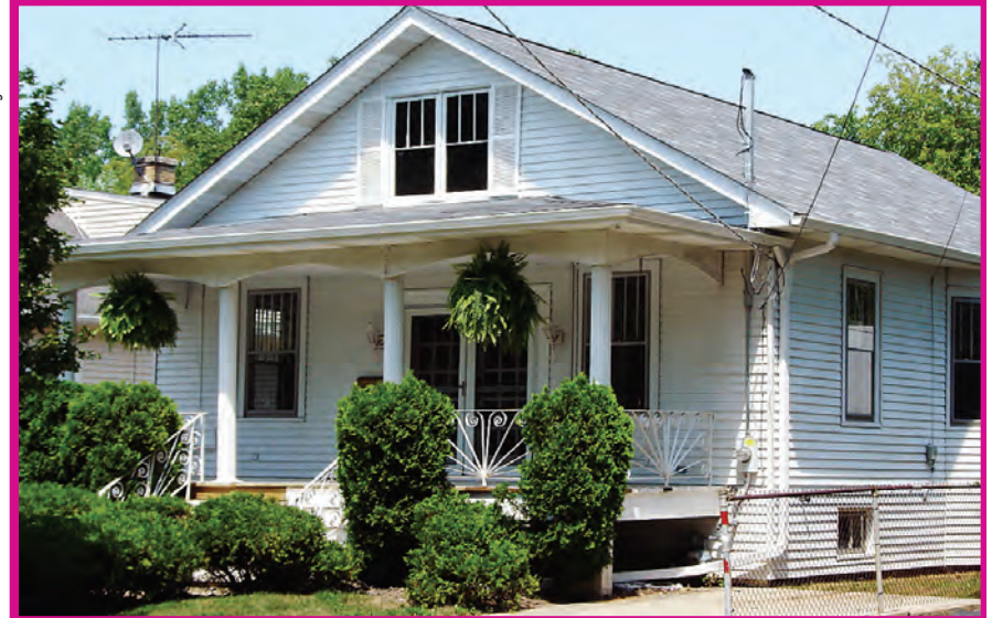
Highland Park gives density bonuses to developers who build affordable units.