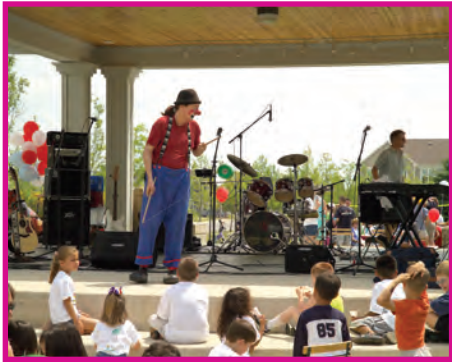
HomeTown Aurora, Aurora, Ill.

and compact, energy-efficient design, namely narrow streets and smaller lots. The smaller than usual suburban lots are offset by 273 acres of open space. Because HomeTown Aurora did not fit neatly into traditional zoning codes, the entitlement process took much longer than it would have for a more conventional subdivision. Early concerns over density and too many school children were never realized; HomeTown Aurora actually generates a $1.2 million surplus for the local school districts.