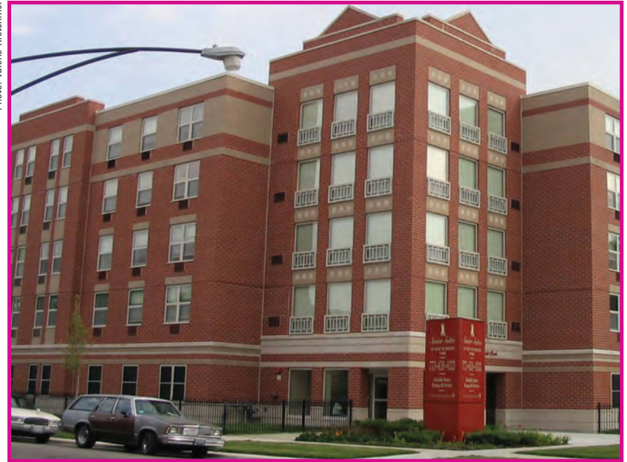
Good parking (above) vs. bad parking (below)