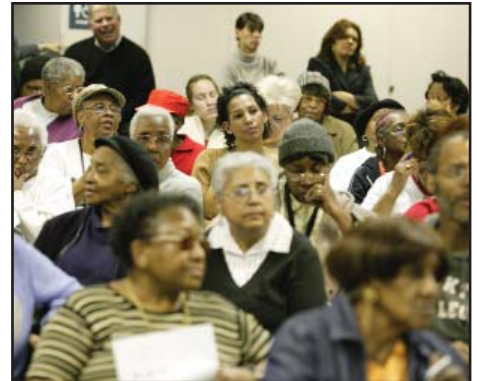
Extensive community participation in the three neighborhoods was key to developing recommendations for transit, jobs and other essential opportunities that reflect residents' collective vision of what their neighborhoods can be.

Starting in 2009, MPC is leading the implementation phase of Reconnecting Neighborhoods, with support from and coordination with the IGAC and other partners. With new direction by the federal government to align housing, transportation and energy investments, Reconnecting Neighborhoods, by its interdisciplinary nature, is poised to be a demonstration project, illustrating the benefits of directing multiple investments in a coordinated fashion to create more vibrant and livable communities.