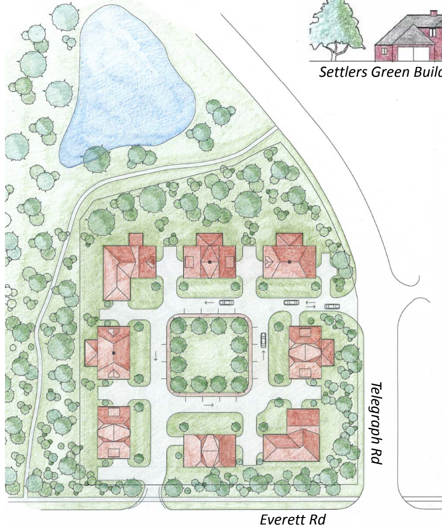
Settlers Green Site Plan

No. of Units: 16 (8 duplex buildings) Land Area: 2.3 acres (100,000 SF) Zoning: B-1 Business District No Variances or Zone Changes Required