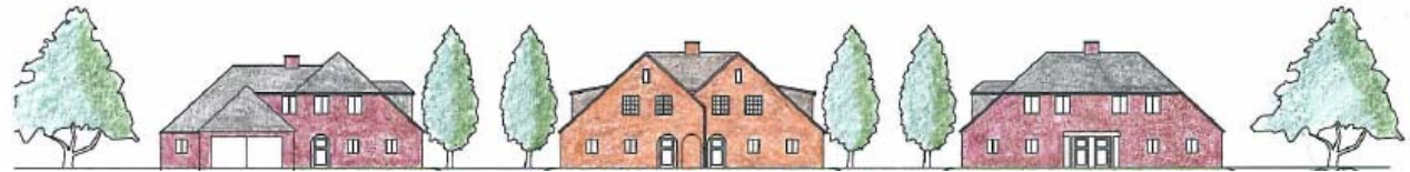
Settlers Green Building Elevations