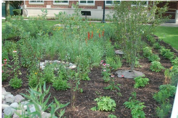
Elmhurst Police Department Rain Garden (2017)