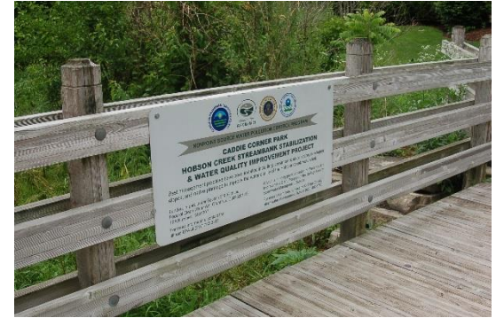
Caddie Corner Park Streambank Stabilization, Woodridge Park District (2013)