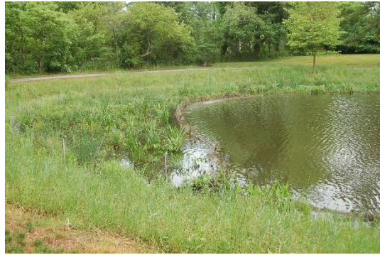
Arboretum Woods Shoreline Stabilization, Lisle Park District (2015)