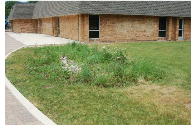
Jefferson Junior High Green Initiatives, Woodridge (2016)