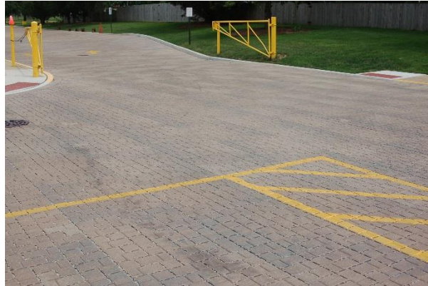
Jay Stream School Permeable Paver Parking Lot, Carol Stream (2016)