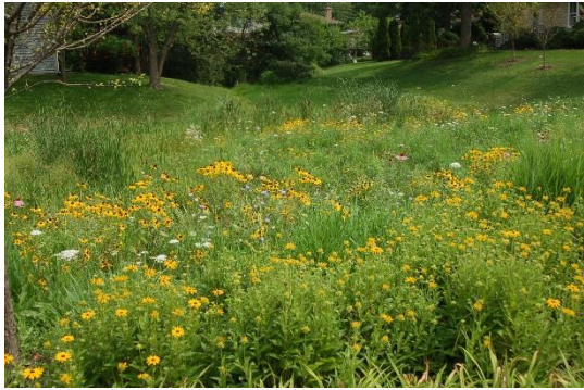
Elizabeth Court Detention Basin, Wood Dale (2015)